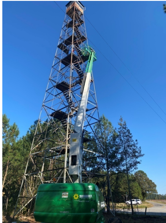
In October 2021, CRATA volunteers dismantled a fire tower in Virginia and transported it back to Alabama to begin its new life as a landmark on Lake Martin.