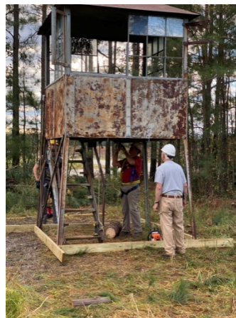
This photo of the tower cab illustrates the amount of work needed to refurbish the old tower.